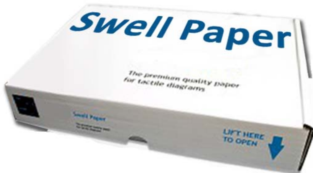
Image of swell paper by American Thermoform

Price: $228.99 in 2019 (each box contains 100 sheets)