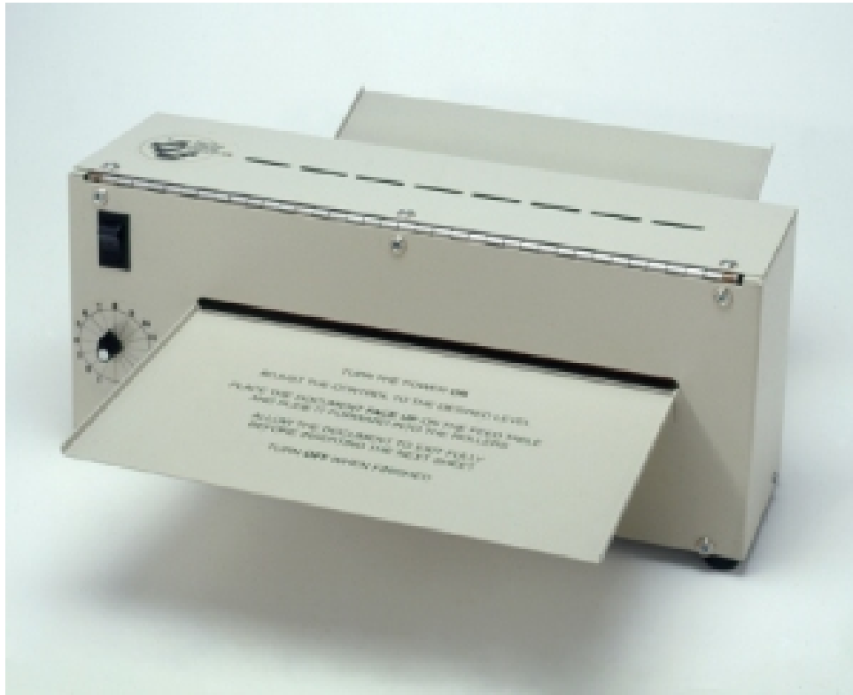
Image of tactile image enhancer

The tactile image enhancer we used is manufactured by Repro-Tronics.